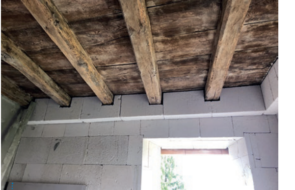
Fig. 6: Upper floor wooden beams

Fig. 5: (a) Electrical system sheaths (b) shoulder pads of the windows