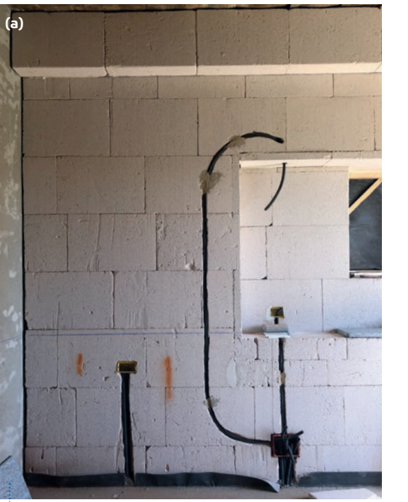
Fig. 5: (a) Electrical system sheaths (b) shoulder pads of the windows

The lower floor bordering the unheated rooms of the cellar turned out to be a structure composed of solid bricks with 360 mm thickness. This structure was