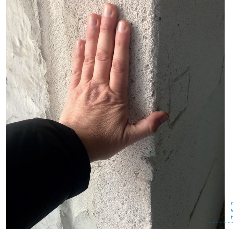
Fig. 3: MultiPOR panels thickness of 140 mm