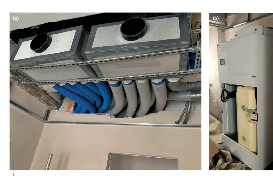
Fig. 7: (a) Exhaust and inlet air plenum (b) VPM machine

The counterframe was effected after wrapping the shoulder pads of the windows with a Multipor panel of only 50 mm thickness. In order to avoid a reduc-